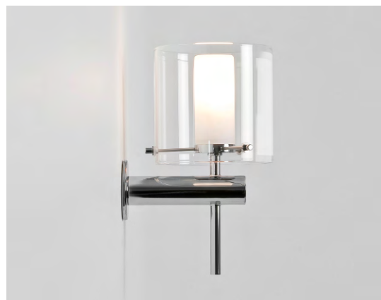
CODE: 1049001 (0342) FINISH: POLISHED CHROME