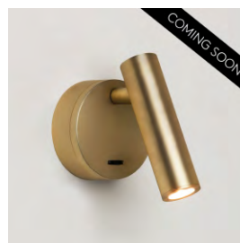
CODE: 1058108 (8481) FINISH: MATT GOLD