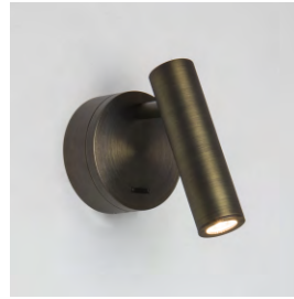
CODE: 1058012 (7356) FINISH: BRONZE