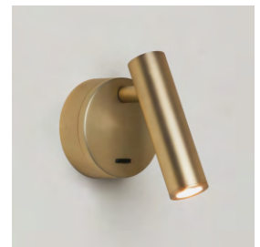
CODE: 1058028 (7547) FINISH: MATT GOLD