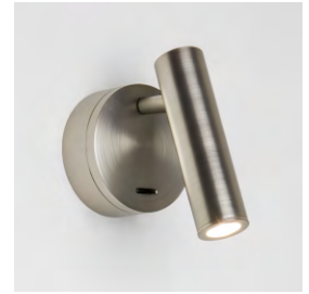
CODE: 1058013 (7357) FINISH: MATT NICKEL