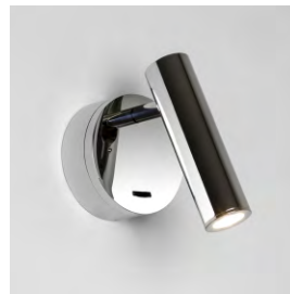
CODE: 1058014 (7358) FINISH: POLISHED CHROME