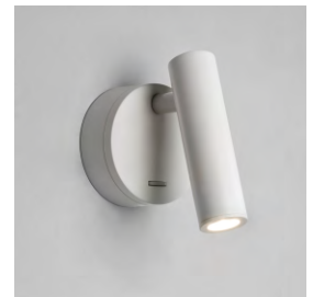
CODE: 1058015 (7359) FINISH: MATT WHITE