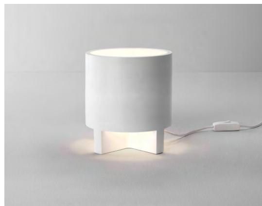
CODE: 1395001 (8115) FINISH: PLASTER

TO MAINTAIN THIS PRODUCT TO ITS BEST CONDITION, PLEASE VIEW OUR CARE AND CLEANING GUIDE ON THE SUPPORT SECTION OF THE ASTRO WEBSITE.