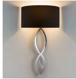
CODE: 1349001 (7371) FINISH: POLISHED CHROME