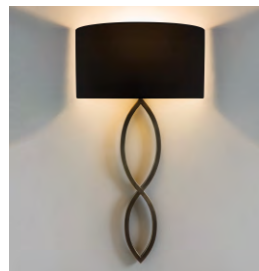
CODE: 1349010 (8260) FINISH: BRONZE

TO MAINTAIN THIS PRODUCT TO ITS BEST CONDITION, PLEASE VIEW OUR CARE AND CLEANING GUIDE ON THE SUPPORT SECTION OF THE ASTRO WEBSITE.