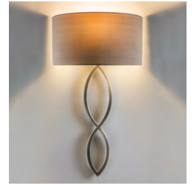
CODE: 1349002 (7372) FINISH: MATT NICKEL