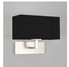
CODE: 1080022 (7098) FINISH: MATT NICKEL