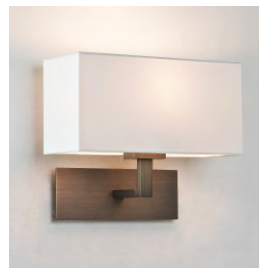
CODE: 1080001 (0424) FINISH: BRONZE

TO MAINTAIN THIS PRODUCT TO ITS BEST CONDITION, PLEASE VIEW OUR CARE AND CLEANING GUIDE ON THE SUPPORT SECTION OF THE ASTRO WEBSITE.