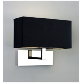
CODE: 1080002 (0516) FINISH: POLISHED CHROME