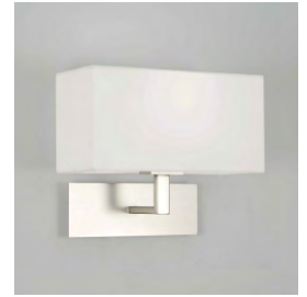
CODE: 1080009 (0763) FINISH: MATT NICKEL