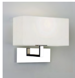
CODE: 1080011 (0865) FINISH: POLISHED CHROME