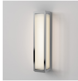
CODE: 1370002 (8328) FINISH: POLISHED CHROME