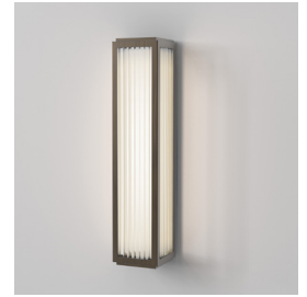
CODE: 1370004 (8330) FINISH: BRONZE

TO MAINTAIN THIS PRODUCT TO ITS BEST CONDITION, PLEASE VIEW OUR CARE AND CLEANING GUIDE ON THE SUPPORT SECTION OF THE ASTRO WEBSITE.