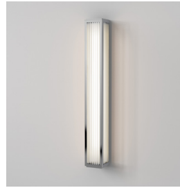
CODE: 1370003 (8329) FINISH: POLISHED CHROME