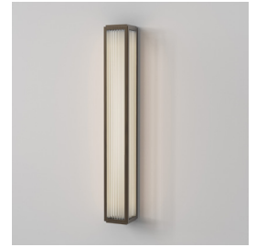
CODE: 1370005 (8331) FINISH: BRONZE

TO MAINTAIN THIS PRODUCT TO ITS BEST CONDITION, PLEASE VIEW OUR CARE AND CLEANING GUIDE ON THE SUPPORT SECTION OF THE ASTRO WEBSITE.