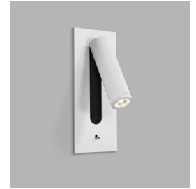
CODE: 1215036 (8103) FINISH: MATT WHITE