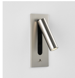
CODE: 1215039 (8106) FINISH: MATT NICKEL

TO MAINTAIN THIS PRODUCT TO ITS BEST CONDITION, PLEASE VIEW OUR CARE AND CLEANING GUIDE ON THE SUPPORT SECTION OF THE ASTRO WEBSITE.