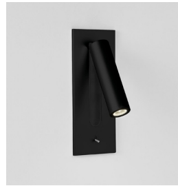
CODE: 1215037 (8104) FINISH: MATT BLACK