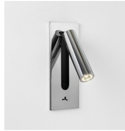
CODE: 1215035 (8102) FINISH: POLISHED CHROME