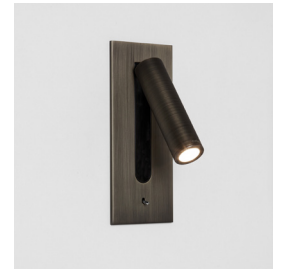
CODE: 1215038 (8105) FINISH: BRONZE