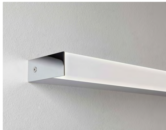
CODE: 1322005 (7491) FINISH: POLISHED CHROME

TO MAINTAIN THIS PRODUCT TO ITS BEST CONDITION, PLEASE VIEW OUR CARE AND CLEANING GUIDE ON THE SUPPORT SECTION OF THE ASTRO WEBSITE.