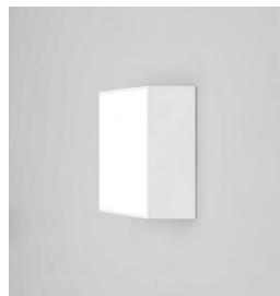
CODE: 1391005 (8023) FINISH: TEXTURED WHITE