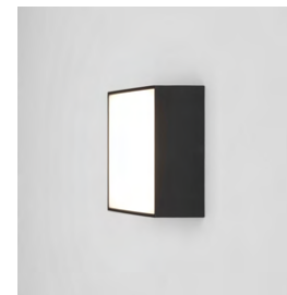
CODE: 1391006 (8024) FINISH: TEXTURED BLACK

THIS PRODUCT IS SUITABLE FOR ONEROUS ENVIRONMENTS AND CAN BE INSTALLED WITHIN FIVE MILES OF THE COAST - THREE YEAR WARRANTY APPLIES.