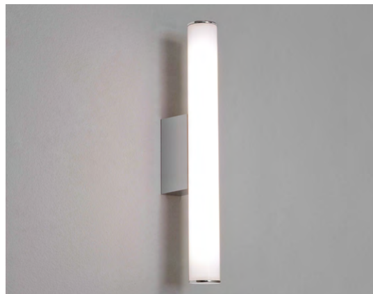
CODE: 1305001 (7101) FINISH: POLISHED CHROME

TO MAINTAIN THIS PRODUCT TO ITS BEST CONDITION, PLEASE VIEW OUR CARE AND CLEANING GUIDE ON THE SUPPORT SECTION OF THE ASTRO WEBSITE.