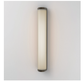
CODE: 1380012 (8483) FINISH: BRONZE

TO MAINTAIN THIS PRODUCT TO ITS BEST CONDITION, PLEASE VIEW OUR CARE AND CLEANING GUIDE ON THE SUPPORT SECTION OF THE ASTRO WEBSITE.