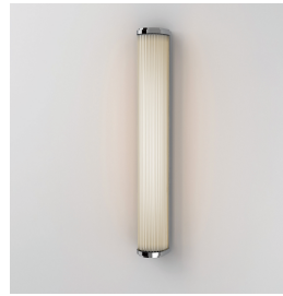
CODE: 1380011 (8482) FINISH: POLISHED CHROME