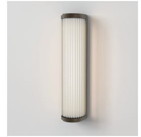
CODE: 1380014 (8544) FINISH: BRONZE

TO MAINTAIN THIS PRODUCT TO ITS BEST CONDITION, PLEASE VIEW OUR CARE AND CLEANING GUIDE ON THE SUPPORT SECTION OF THE ASTRO WEBSITE.