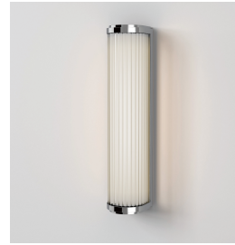
CODE: 1380013 (8556) FINISH: POLISHED CHROME